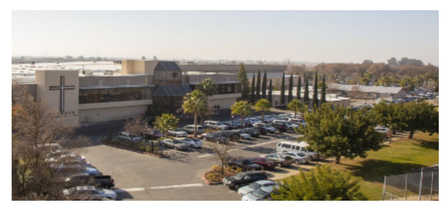
Rancho Arroyo - Bethany Slovic Missionary Church

California, Norton Air Force Base, Port Magu Naval Base, and the Federal Building in Los Angeles, California.